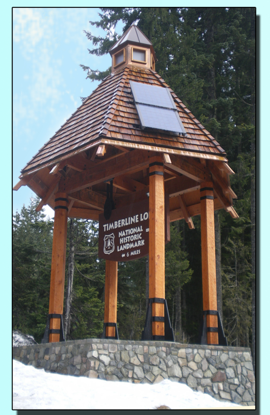
Stain and protect timber frame structures and gazebos