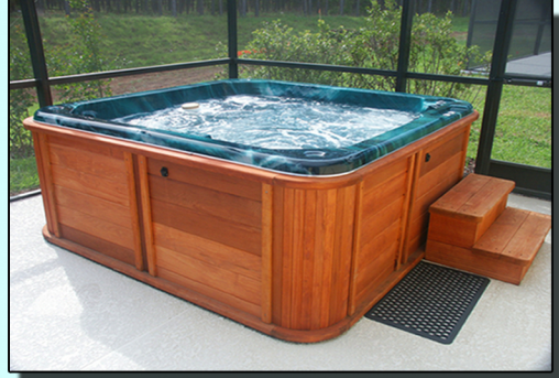
Treat hot tubs and garden furniture