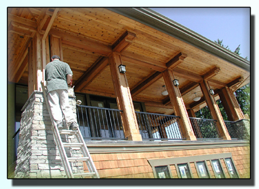
Protect wood ceilings and exterior soffits

Transparent wood stain that won't disappoint